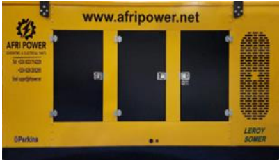
PMG Exciting System Available as Optional